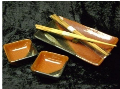
JAPANESE SUSHI SET 4059