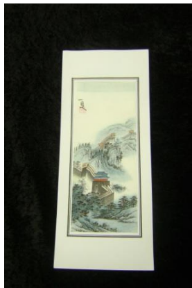
CHINESE INK & WASH PAINTING