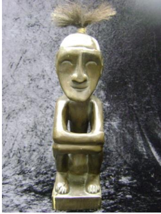
TRUNYAN FIGURE (PHILLIPINES) 2472, 2536