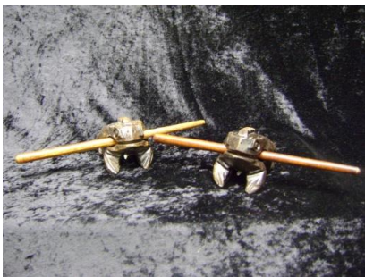
GUIRO (THAILAND) 4316, 4509