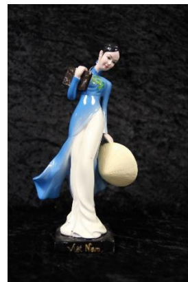
PORCELAIN DOLL (VIETNAM)