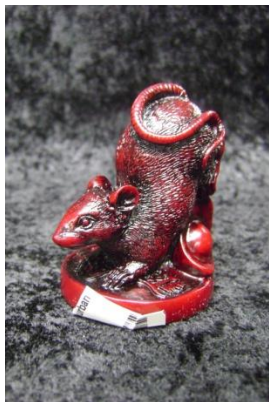
CHINESE ZODIAC FIGURINE – RAT 3486