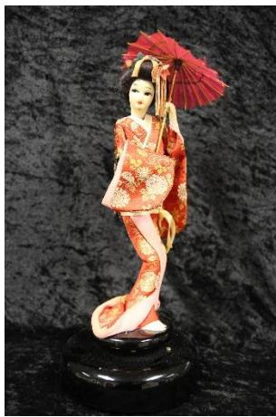
JAPANESE DOLL 2096