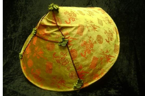
CONICAL Asian Hat 3601