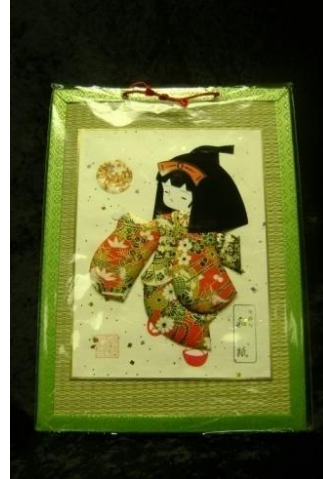
JAPANESE GIRL/KIMONO WALL HANGING 1718