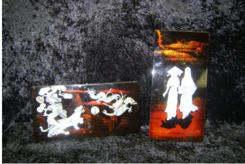
VIETNAMESE WALL DÉCOR