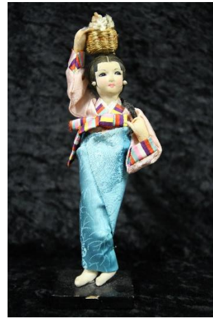
KOREAN DOLL 2095