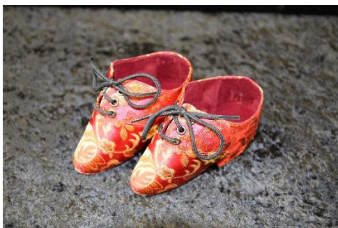
CHINESE LOTUS SHOES 2519