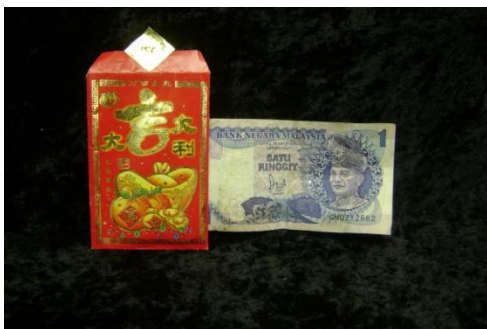
LUCKY MONEY ENVELOPE & MONEY (MALAYSIA)