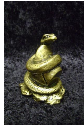
CHINESE ZODIAC FIGURINE – SNAKE 3478