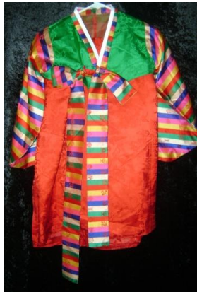
GIRLS HANBOK (KOREA)