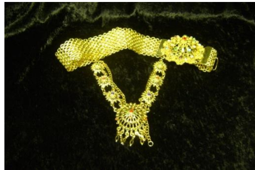
DANCE RAM THAI JEWELLED BELT (WEDDINGS) –