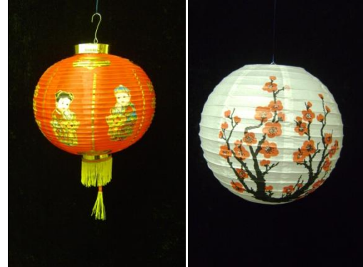
CHINESE LANTERNS CHINESE PARTY LANTERN – 3763, 3768 CHERRY BLOSSOM LANTERN – 3713, 3756