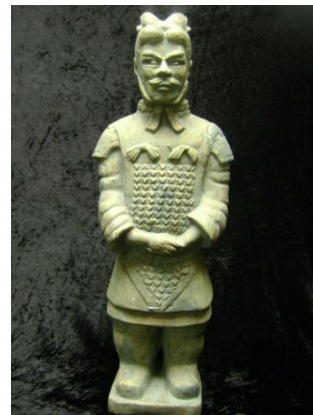
TERRACOTTA SOLDIER (CHINA)