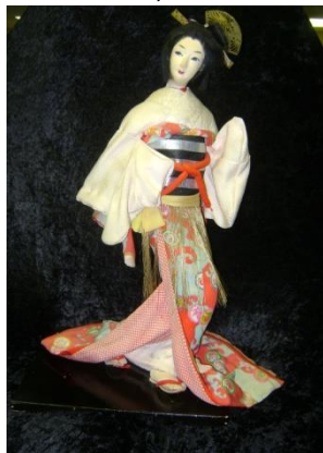
JAPANESE GEISHA DOLL 2721