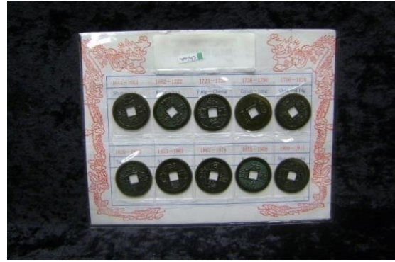
OLD COINS (CHINA)