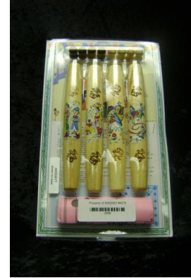
KOREAN YUT GAME