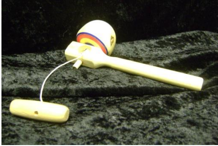
KOREAN TOP 1067