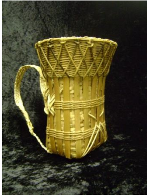
SMALL HMONG BASKET (VIETNAM) 1974