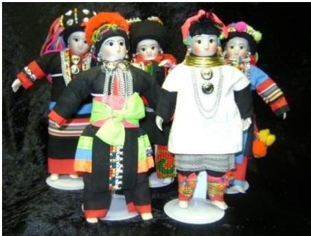
HMONG DOLLS 1978, 1978, 1979, 1980, 1981, 1982, 1983, 1984, 1985, 1988, 1989, 1990, 1992