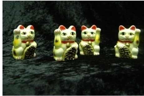
MANEKI NEKO (JAPAN) 4063, 4064, 4066, 4639