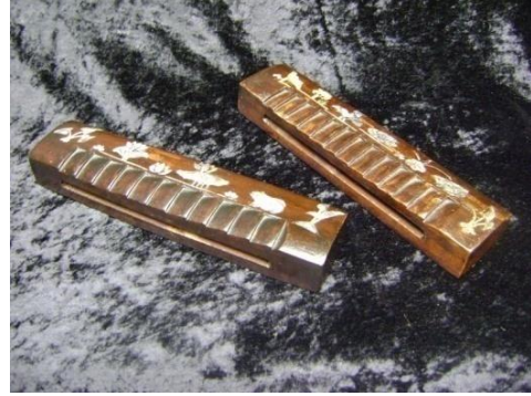
GUIRO BLOCK (VIETNAM) 3488, 3491