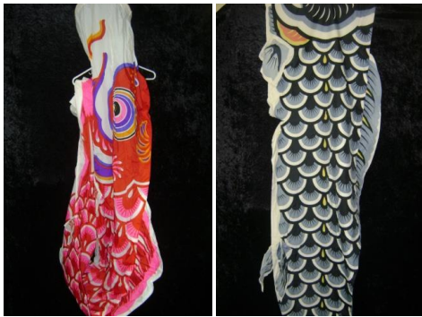
LARGE STREAMER FOR KIDS DAY (JAPAN) 1693, 1706