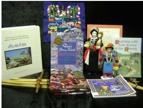
HMONG CULTURE KIT 4841