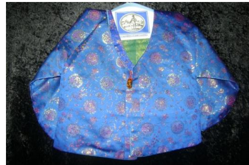
BOYS HANBOK (KOREA)