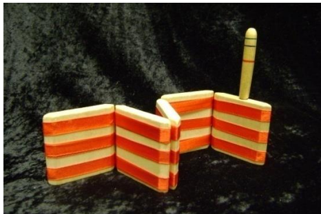
JACOB'S LADDER TOY 2136