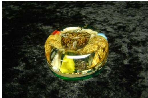
REAL CRAB AMBER 4415