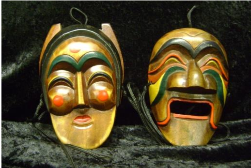
KOREAN MASKS 1064, 1065