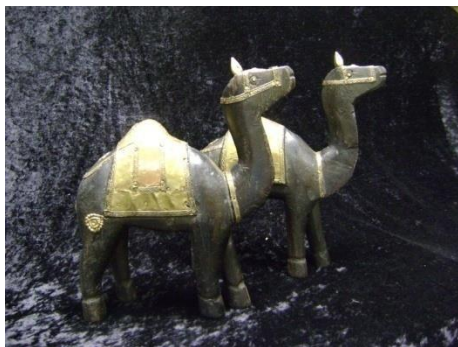
WOODEN CAMEL (INDONESIA) 2537, 2538