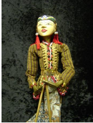
JAVANESE SHADOW PUPPET/ INDONESIAN ROD PUPPET 4626