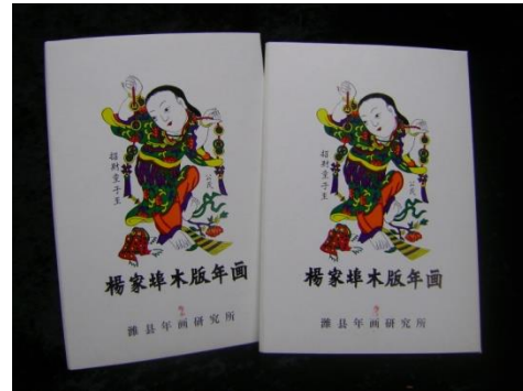
CHINESE PRINTS 4349, 4350