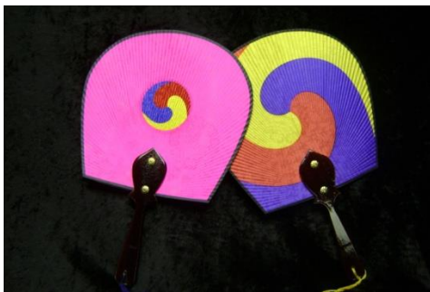
TRADITIONAL KOREAN SILK FAN 2661, 2662, 2665, 2666, 2674 3473, 3591, 4199