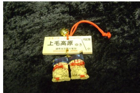
CHARM W/ TRAIN TICKET (JAPAN) 1734