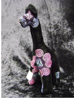
HMONG ANIMAL TOY 4185