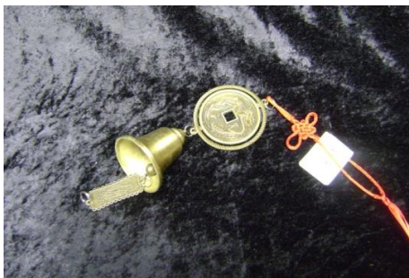
CHINESE KNOT FENG SHUI BELL 2483