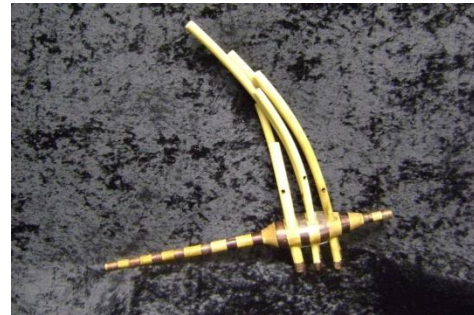
HMONG QEEJ 1729