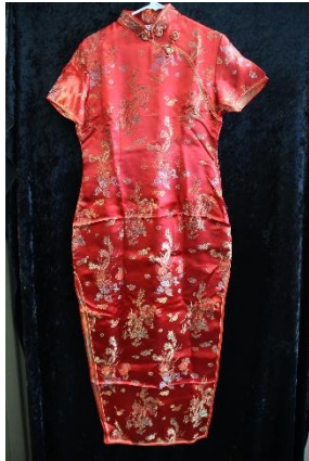
QIPAO CHEONGSOM 2520