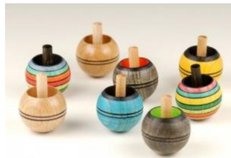
JAPANESE SPINNING TOPS W/BOARD 2133