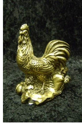
CHINESE ZODIAC FIGURINE – ROOSTER 3482