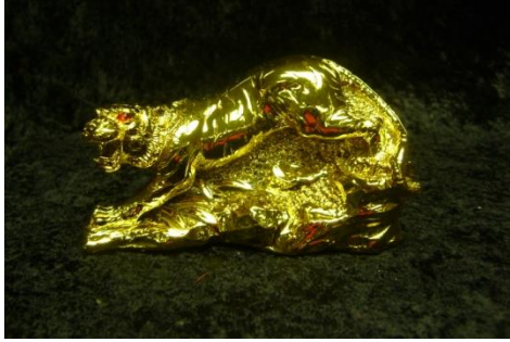
CHINESE ZODIAC FIGURINE – GOLDEN TIGER 3485