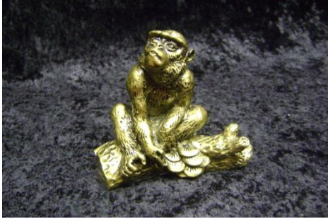
CHINESE ZODIAC FIGURINE – MONKEY 3481