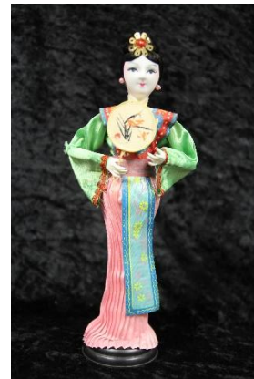
CHINESE DOLL 2094