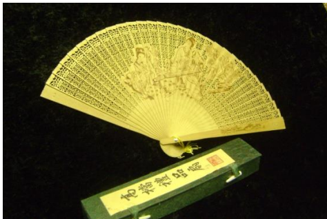
CHINESE TRADITIONAL PAPER FAN 5226