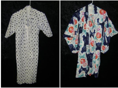
YUKATA – SUMMER KIMONO (JAPAN) 1721, 1722