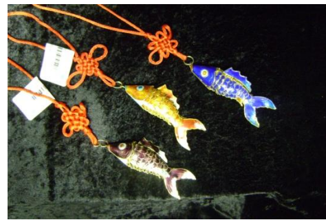
GOOD LUCK CARP (CHINA)