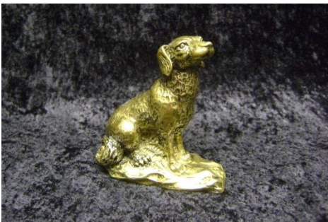
CHINESE ZODIAC FIGURINE – DOG 3483