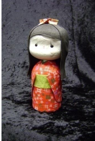
KIOSHI DOLL RATTLE – JAPAN 4195