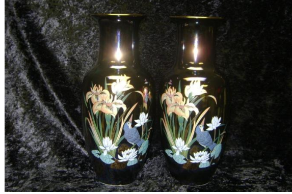
JAPANESE CLOISONNE ENAMEL VASES 1715, 1716