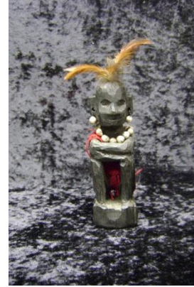
RICE GOD FIGURINE (PHILLIPINES) 4422