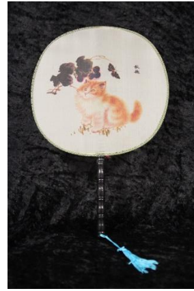
HONGZHOU SILK FAN 2092