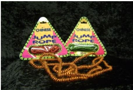
CHINESE JUMP ROPES 4334, 4335, 4336, 4337, 4475