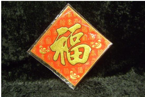
CHINESE NEW YEAR SYMBOL 3457