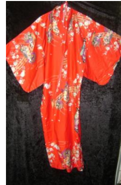
KIMONO (Japan) 4045