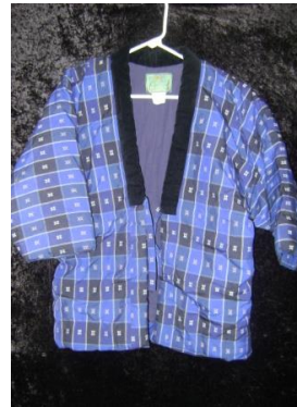
HAUTEN – HOME WINTER JACKET (JAPAN) 2002