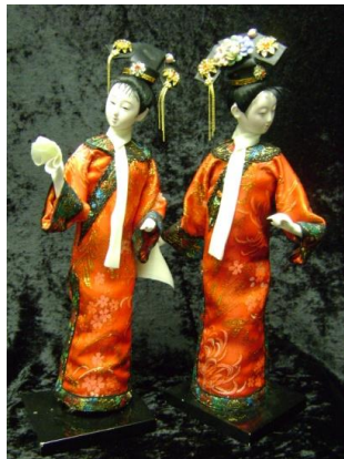
“LADY FROM THE QING DYNASTY” CHINESE DOLLS – 2723, 2724