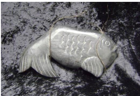
BLACK KOI CARVING (INDONESIA) 1719