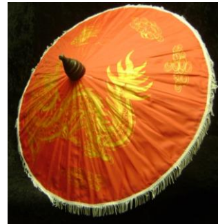
ROYAL DRAGON UMBRELLA (CHINA) 3710