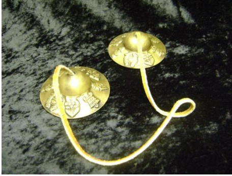
TINGSHA PRAYER CHIMES 4413