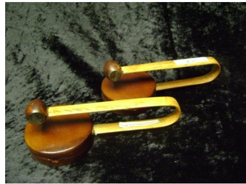
SONG BAN CLAPPER (VIETNAM) 2973, 2974