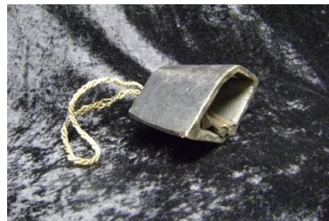
COW BELL (INDONESIA) 2755, 2756