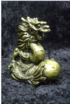
CHINESE ZODIAC FIGURINE – DRAGON 3477