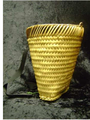
LARGE HMONG BASKET (VIETNAM) 1975