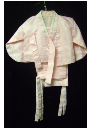
GIRLS HANBOK (KOREA)