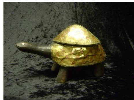
WOODEN TURTLE (INDONESIA) 2468