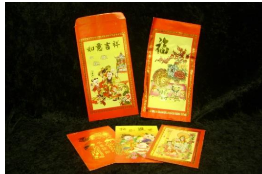
LUCKY MONEY ENVELOPE (VIETNAM) 3932, 3933, 3934, 3938, 3945, 3946, 3980, 3988