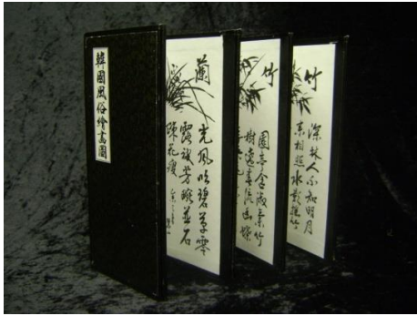
KOREAN MINIATURE DIVIDER 2720