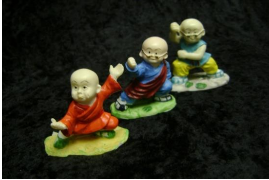
CHINESE SHAOLIN MUNK FIGURINES