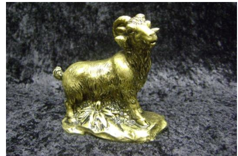
CHINESE ZODIAC FIGURINE – GOAT 3480