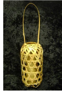
FLOWER VASE WALL HANGING (JAPAN) 1741