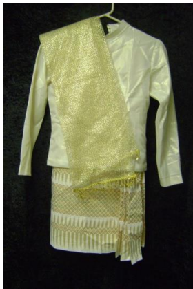
THAI SIWALAI (3 PIECES)