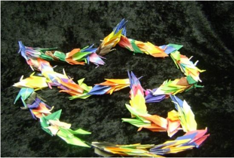
ORIGAMI CRANES (JAPAN) 2126