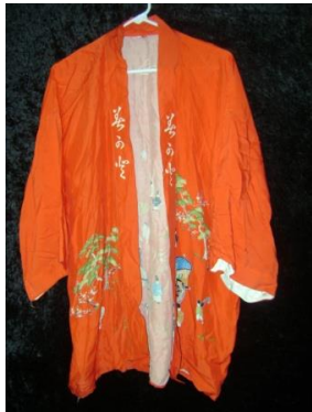
KIMONO (JAPAN) 1966