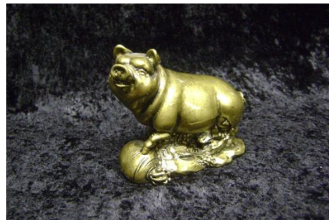
CHINESE ZODIAC FIGURINE – PIG 3484