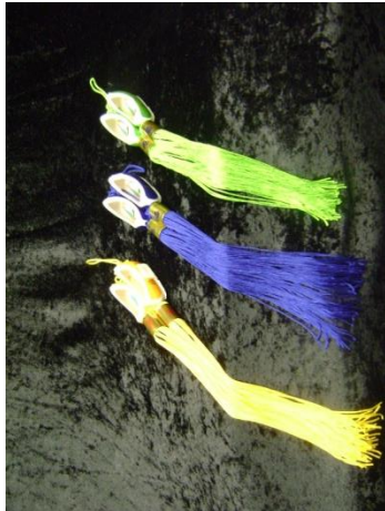
KOREAN SHOES W/ TRADITIONAL KNOTTING 2679, 3598, 3599