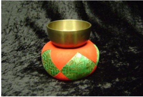
RIN GONG (JAPAN) 3983