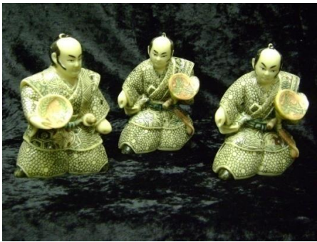
JAPANESE SAMURAI FIGURINES 2702, 2703, 2718, 2719, 2726, 2727