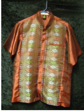
Traditional HMONG Men's Shirt 5225