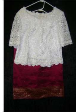
THAI RUEAN TON