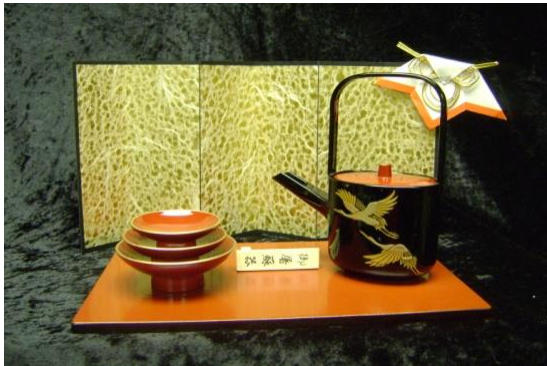
JAPANESE SAKI SET 4058