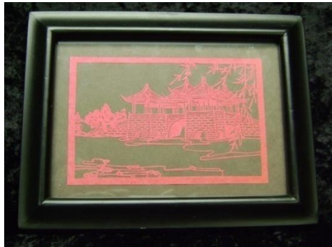
CHINESE FOLK PAPER CUTS 4370, 4371, 4372, 4373, 4374, 4375, 4376, 4533, 4534