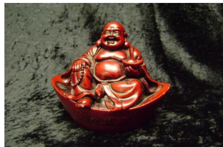
BUDDHA FIGURINE (JAPAN) 4432