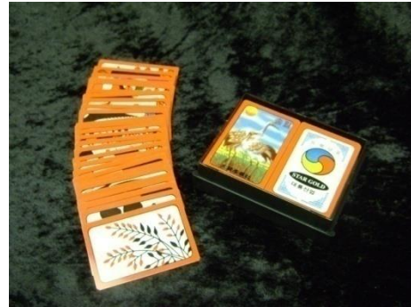
KOREAN HWA-TU GAME 2692, 2693, 2694