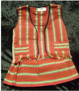
GIRLS OUTFIT (PHILLIPINES) 4686