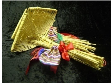
RICE STRAINER (KOREA) 2669, 2670, 3469