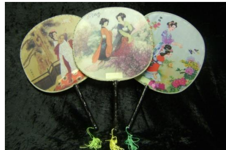
HANGZHOU SILK & BAMBOO FANS (CHINA) 2732, 3475, 3475, 2092