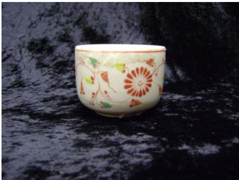
TEA CUP (VIETNAM) 3615