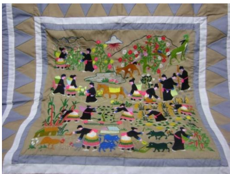
HMONG STORY CLOTH 1720, 1725, 1977, 2003, 4275, 4286, 4287, 4717, 4722