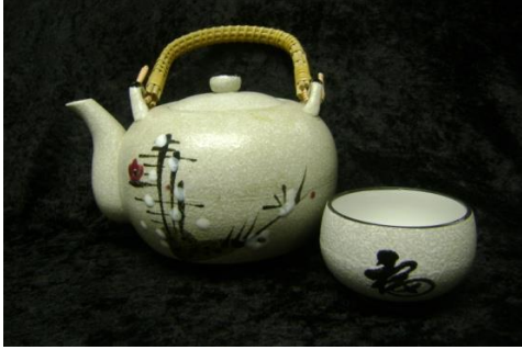
TEA POT & TEA CUP (JAPAN) 2018, 2019