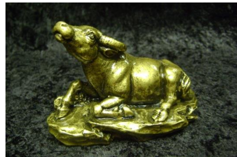
CHINESE ZODIAC FIGURINE – OX 3476