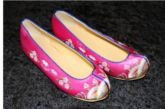
HANBOK FLOWER SHOES 2514