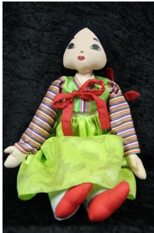
KOREAN DOLL WEARING HANBOK 2107