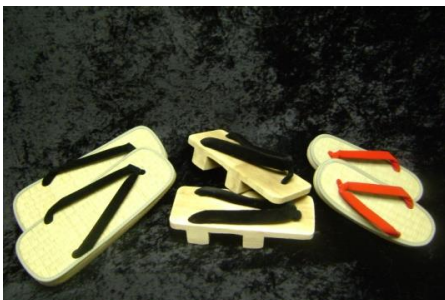
BLACK ZORI SANDALS (JAPAN) – 4054 WOODEN SANDALS (JAPAN) – 4050 RED ZORI SANDALS (JAPAN) - 4052