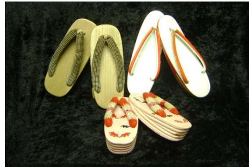
GETA SHOES FOR KIMONO (JAPAN) 1730, 1731, 1732