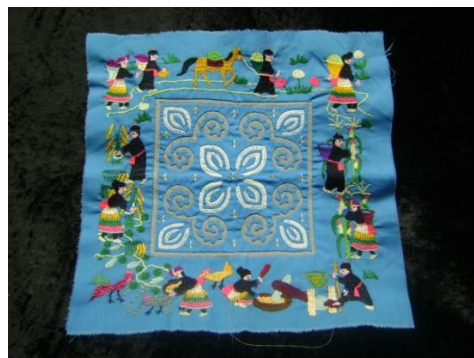
HMONG STORY CLOTH 1977