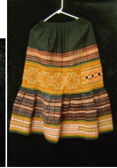
HMONG Batik Skirt 4687, 5224