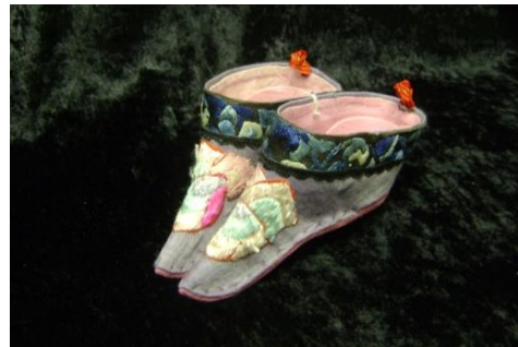
CHINESE LOTUS (FOOT BINDING) SHOES 4204