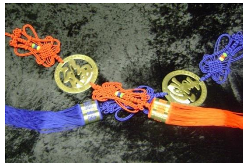
KOREAN MEDALLION W/TRADITIONAL KNOTTING 2704, 2705, 2712, 2713, 2729, 2730