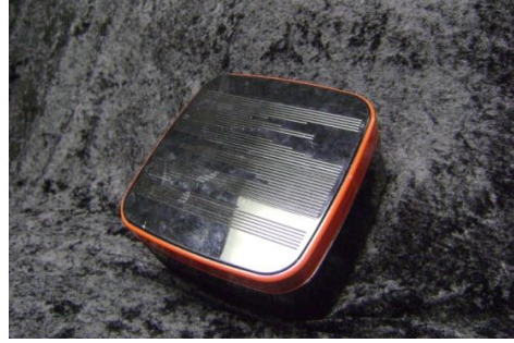
JAPANESE LUNCHBOX 1950