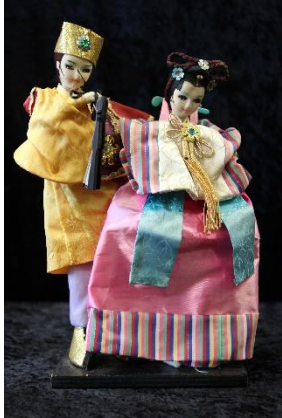
KOREAN WEDDING DOLLS 2522