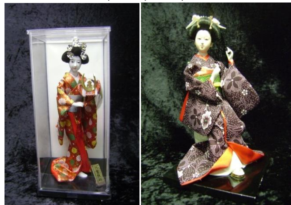
JAPANESE KABUKI/GEISHA DOLLS 2134, 2714, 2716, 2717