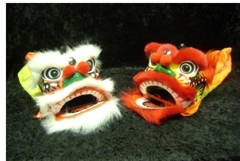
CHINESE LION DANCE PUPPET