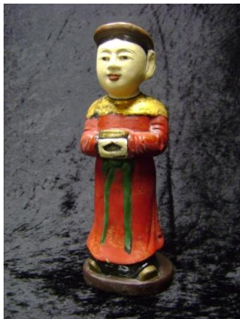
VIETNAMESE STATUE (TRADITIONAL CLOTHING) 2445, 2446