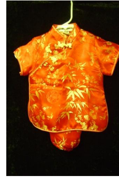
AO DAI OUTFITS (VIETNAM)