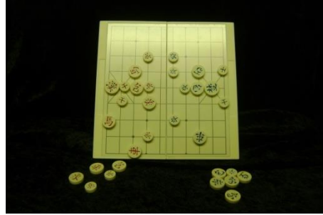
CHANG-GI (KOREAN CHESS) 1066