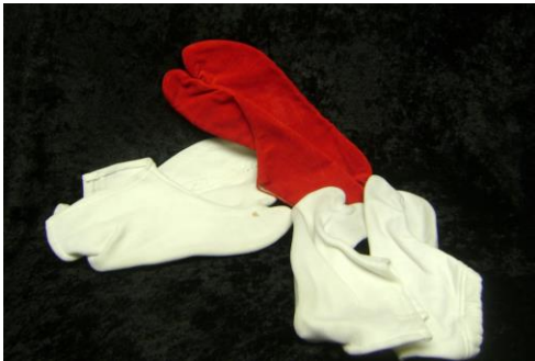
TABI SOCKS FOR GETA SHOES (JAPAN) 1726, 1727, 1728