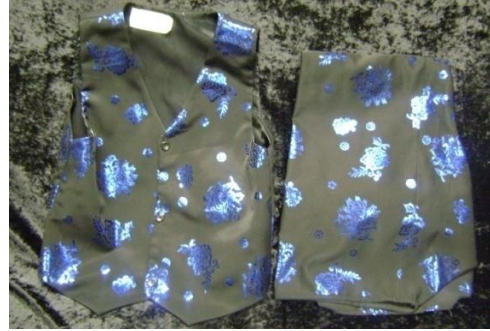
HMONG Clothing (Male) 4187