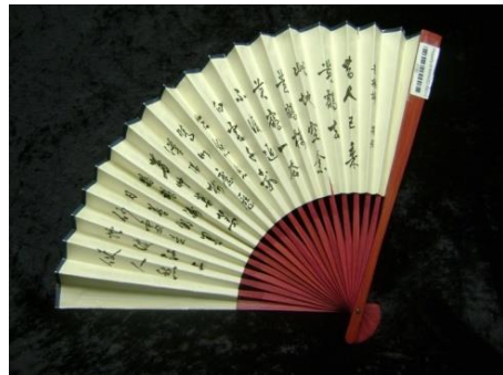
JAPANESE CALLIGRAPHY FAN 4196, 4197, 4421