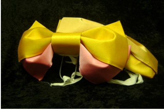
OBI (JAPAN) 1952, 1953