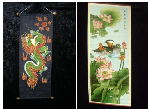
CHINESE SCROLLS DANCING DRAGON – 3705 CHINESE DUCKS - 3788