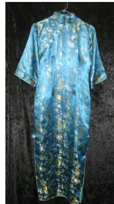
CHEONGSAM DRESS (China) 4417