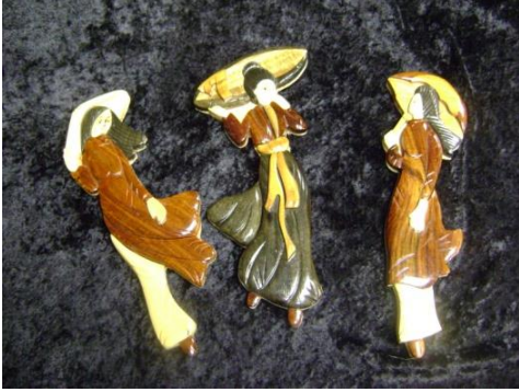
VIETNAMESE WOMAN WALL DÉCOR (WOODEN) 2680, 2681, 2682, 2686, 2687, 2688, 2689, 2690, 2691