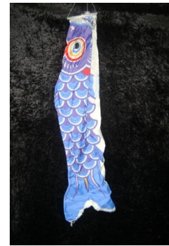
SMALL STREAMER FOR KIDS DAY (JAPAN) 1707, 1708, 1709, 1710