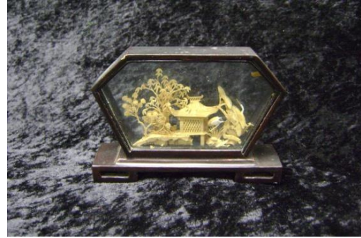
CHINESE CORK SCULPTURE 4007