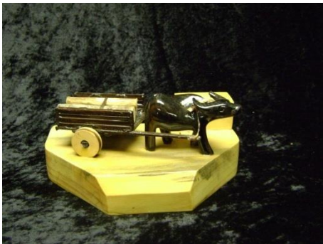
CARABAO ANIMAL (PHILLIPINES) 4420