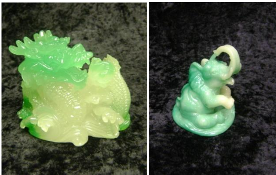
JADE FIGURINES (CHINA)