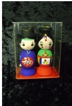
MINIATURE TRAD. WEDDING DOLLS (KOREA)