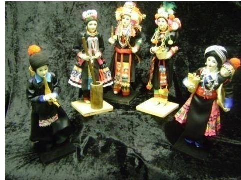
HMONG DOLLS 1993, 1994, 1996, 1997, 1998, 1999, 2123, 2124, 2125, 2127, 2128, 2129