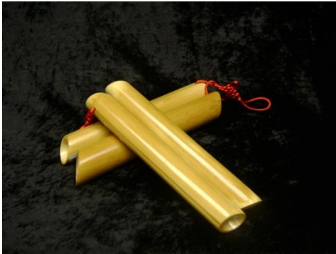
BAMBOO CHIMES W/TRAD. KNOTTING (CHINA) 2448, 3600