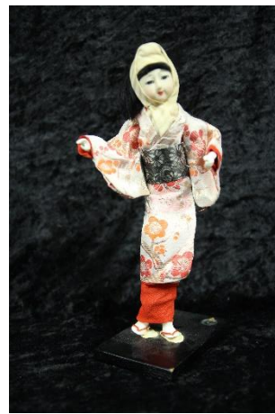
JAPANESE DOLL 2097