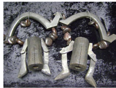
AXBELL/YOKE & BEADS (THAILAND) 3489, 3490