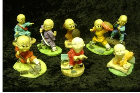
CHINESE SHAOLIN MUNK FIGURINES

4051, 4060, 4068, 4105, 4120, 4127, 4163, 4166