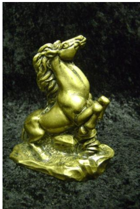
CHINESE ZODIAC FIGURINE – HORSE 3479