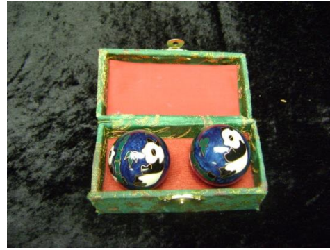
CHINESE BOADING BALLS W/PANDA DESIGN 2698, 2700