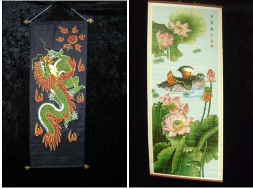
CHINESE SCROLLS DANCING DRAGON – 3705 CHINESE DUCKS - 3788