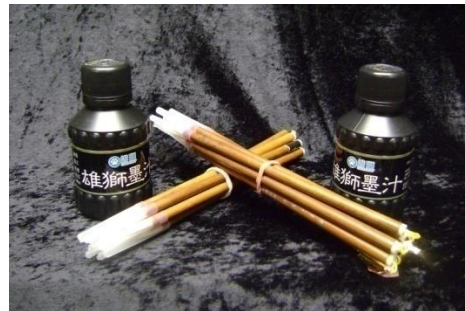
BRUSH WRITING CALLIGRAPHY SET (JAPAN) 4282