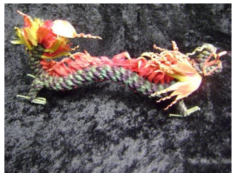
CHINESE DRAGON 4848