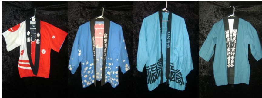
HAPPI FESTIVAL JACKET (JAPAN) 2056, 2057, 2058, 2059, 2060