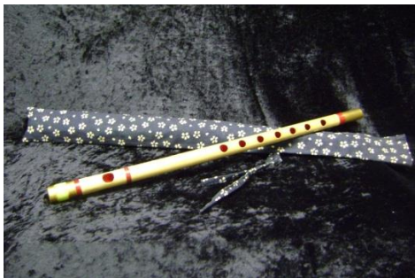
YOKOBUE (JAPAN) 1724, 2132, 2424