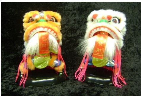
CHINESE NEW YEAR DRAGON TOY

4051, 4060, 4068, 4105, 4120, 4127, 4163, 4166