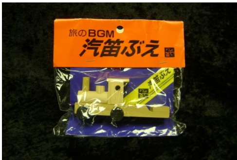
TOY TRAIN WHISTLE (JAPAN) 1743