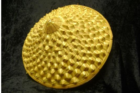
BAMBOO FARMER'S HAT 4653