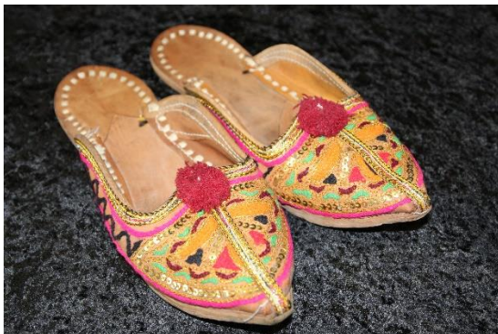
TURKISH MIDDLE EASTERN SHOES