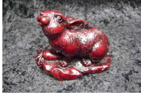
CHINESE ZODIAC FIGURINE – RABBIT 3487