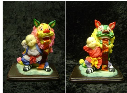
CHINESE DRAGON COSTUME FIGURINE