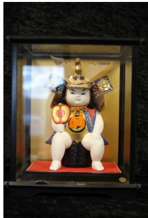
KENTARO - NATURE BOY STATUE (JAPAN) 2108